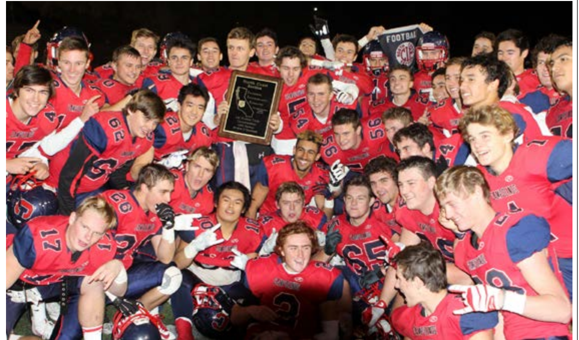
An ecstatic Cougar football team will return to the State title game.